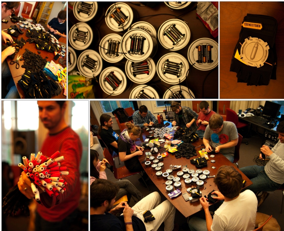
Figure 2: Building the Speaker Gloves

employed minimal tools. The prototype designs were quite basic, but nonetheless allowed testing on usability and interaction experience (Figs. 3, 4). While the necklace and jacket designs served the basic purpose of amplification, they felt bulky and difficult to control, especially the directionality of sound. On the other hand, the close proximity and controllability of the gloves in relationship to the phone seemed to provide a much more satisfying, immediate, and transparent user experience.