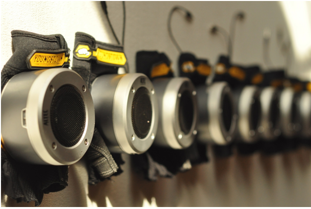
Figure 4: Selected Prototype Design: Speaker gloves

the Objective-C programming language using the XCode development environment. The iPhone SDK provides tools for graphically designing and testing user interfaces (Interface Builder), and projects can include C or C++ code. To streamline instrument development, an additional layer of abstraction has been created on top of the iPhone SDK through the MoMu Toolkit, greatly simplifying audio input/output, synthesis, and on-board sensing among other things [1].