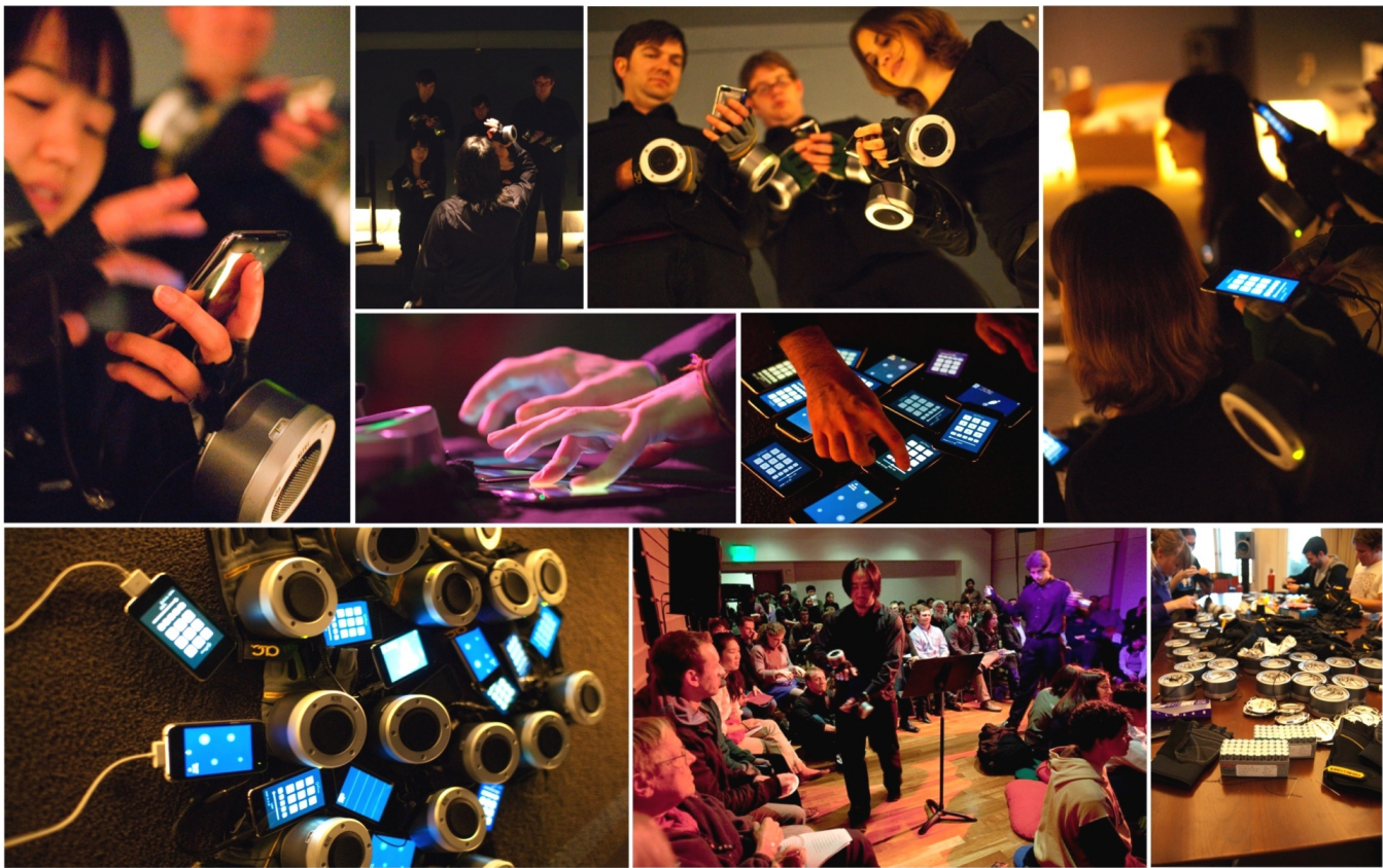
Figure 1: The Stanford Mobile Phone Orchestra

2007, as a repertoire-based ensemble using mobile phones as the primary instrument, was intended to further these concepts as well as explore new possibilities. The increasing computational power of mobile phones has allowed for sound synthesis without the aid of an external computer. In fact, mobile phones have come to be regarded more as “small computers” with PC-like functionality than as simply phones with augmented features. For the purpose of music making, one may even regard the phone as being superior to computers, offering light-weight yet expressive interactive techniques made possible by its various on-board sensors.