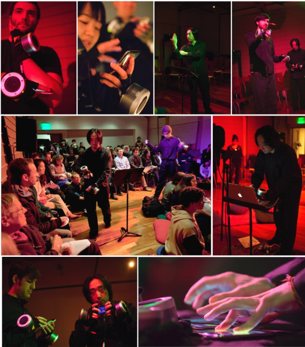
Figure 5: Stanford Mobile Phone Orchestra Concert: December 3, 2009

A concert in December 2009 gave MoPhO an opportunity to explore capabilities provided by these new hardware and software platforms. The instruments and pieces presented in this performance were built using the Mobile Music Toolkit