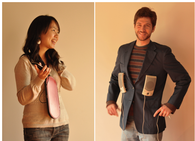
Figure 3: Prototype Designs: Speaker necklace and speaker jacket

The change in hardware consequently led to changes in the software environment. The previously used Nokia N95 smartphones run Symbian OS, use C++ and Python programming languages, and require a somewhat complex ini-