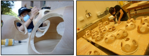
Figure 2. Making speaker arrays from salad bowls.

the ground up. Secondly, it was necessary to finalize the hardware specification for the ensemble and address the practical aspects of how each SLOrk station works. Lastly, the software architecture for SLOrk was designed to accommodate the special needs of the ensemble.