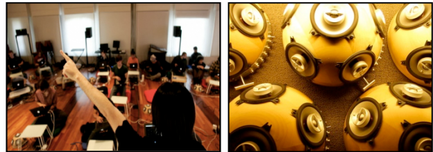
Figure 1. SLOrk classroom; SLOrk speaker arrays.

Offstage, the ensemble serves as a one-of-a-kind learning environment that explores music, computer science, composition, and live performance in a naturally interdisciplinary way. It also provides a unique research platform for exploring new performance paradigms, instruments, and novel expressive uses of technology.