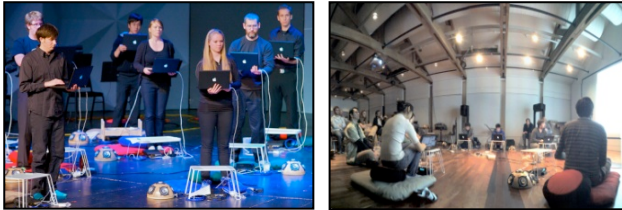
Figure 5. Stanford Laptop Orchestra performs onstage and in more intimate chamber settings

The Stanford Laptop Orchestra commenced its inaugural term in Spring 2008, offering a number of performances, taking place as part of the “Composing, Coding, and Performance for Laptop Orchestra” course. This section describes some of the performances and the ideas associated with each.