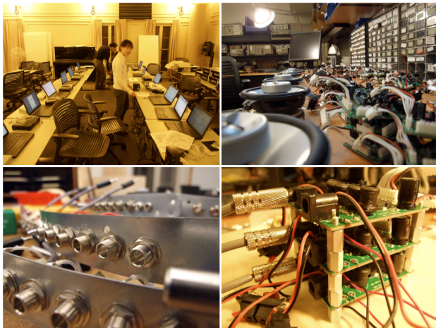
Figure 3. Building hardware and software.

SLOrk makes use of twenty multi-channel speaker arrays. Each speaker array consists of six discrete car audio speakers, six onboard amplifiers, a hemispherical wooden enclosure, six ¼” mono TS audio jacks, a single ON/OFF switch, and requires a single 12V DC power supply. The overall design goal was to provide an acoustical “point source” immediately adjacent to a performer in a lightweight and mobile fashion. This strongly couples each laptop performer with their own localizable sound and more closely emulates typical acoustical instruments in traditional ensembles.