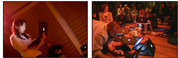
Figure 7. Chamber conducting; 20 laptops playing.

nous sommes tous des Fernando... , by Robert Hamilton, is an improvisatory work written for the SLORK using q3osc [5]. A screen projected in front of the hall displays a virtual environment, in which performers control avatars: firing sound-projectiles which bounce or home-in on individual performers, creating sound events with every bounce/collision.