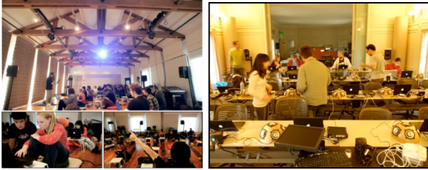
Figure 8. SLOrk classroom in action.

the conductor's gestures, and come to understand the artistic aims of a piece. Through rehearsals students learn to become a sensitive performer, focusing on the quality of the sound generated and striving for high musicality.